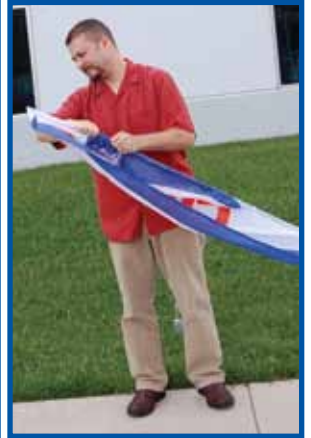
With mast inside banner, pull banner downward so mast meets end of banner pocket.