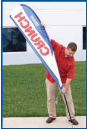
Slide banner over length of mast. Use your foot to brace the mast against the ground or floor.