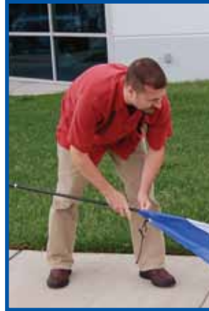
Slide Mast into pocket at bottom of banner. Bottom of banner will have a black tip of mast meets end of cord with a silver clip.