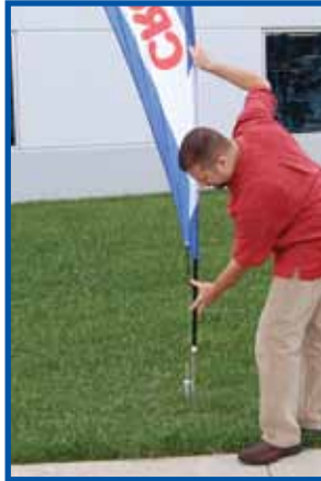
Slide mast bottom over top of stake.