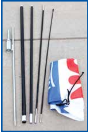
Stake, four piece mast and banner (drop shape shown in example)