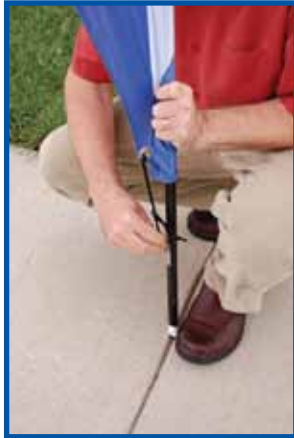
Holding the banner in place with one hand, attach the silver clip to the eyelet on the mast.