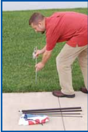
Place stake into ground. If required a hammer can be used to gently tap the stake into the ground.