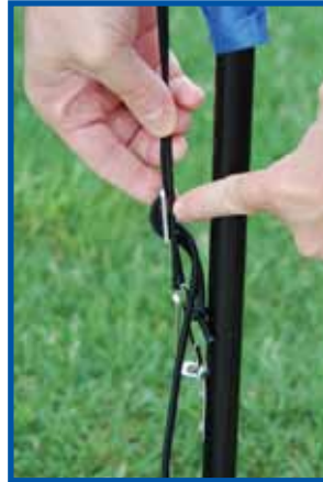
Lengthen or shorten cord length to adjust tension on banner as needed.