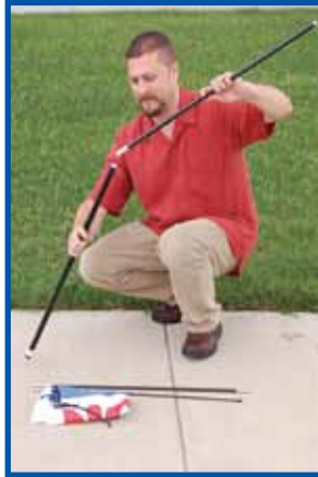
Assemble mast. Thickest section to thinnest.