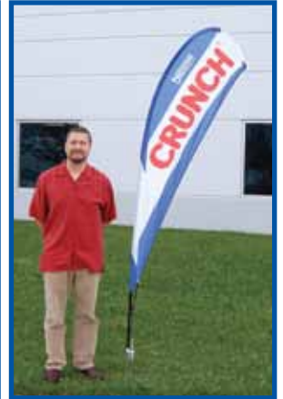
To break down, repeat steps in reverse. Use caution as the banner mast is now under tension.